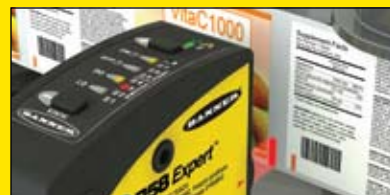
High-Speed Detection in Printing and Labeling

Fast and reliable detection of registration marks in variety of industries